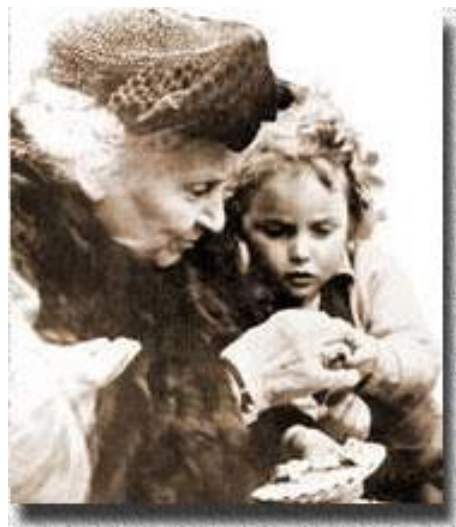
Dr. Maria Montessori

Please save it in your Computer before you edit.